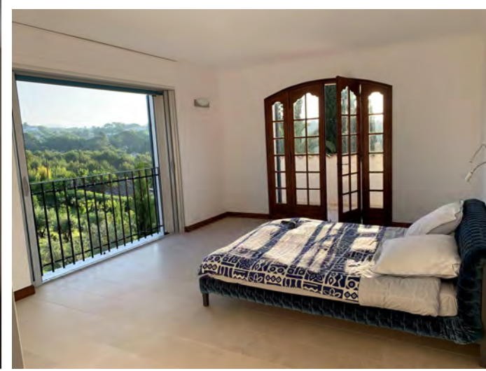
High quality workmanship, authenticity and modern convenience will be found throughout the residence